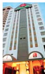
The Ibis Hotel

*Delegates are required to book and confirm their own accommodation at the Grand Chancellor and Mercure Hotels.