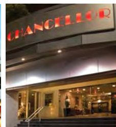
Hotel Grand Chancellor