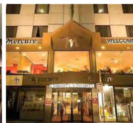
Mercure Welcome Hotel