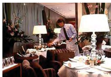
Three Degrees restaurant