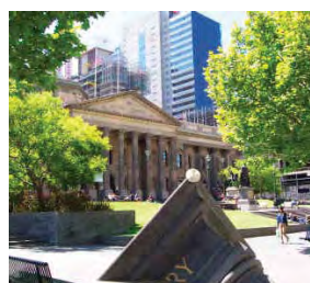
State Library of Victoria

The State Library of Victoria, corner of Swanston and La Trobe Streets, is a magnificent example of 19th century civic architecture. The conference centre combines historic elegance and modern facilities, providing a unique and much sought after meeting destination in the heart of Melbourne. Entry to the State Library Conference Centre is via Entry 3 on La Trobe Street.